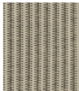
TXT - 04 Truffle

Contact us at hello@katieleede.com to inquire about our custom capabilities for this design 121 WEST 27TH STREET 703 NEW YORK CITY 10001 646-707-3569 www.katieleede.com