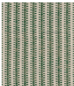
TXT - 03 Moss