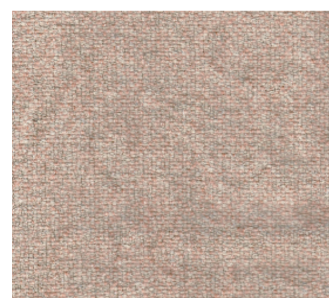
TT-05 Sun-kissed Stucco