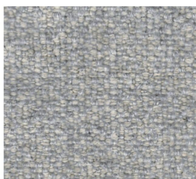
TT-01 Tumbled Limestone