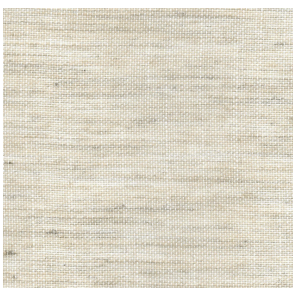
BT - 01 Crushed Seed