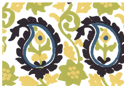
ZRA-02 Atlas Sprig