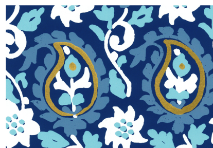
ZRA-05 Lapis Oasis