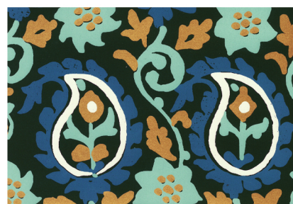
ZRA-04 Alboran Sea