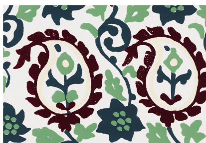
ZRA-03 Desert Flower