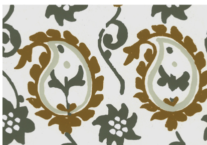
ZRA-01 Sand Cat