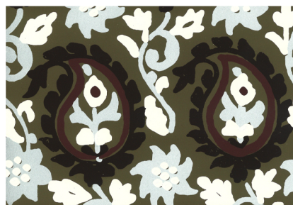
ZRA-06 Bahia Palace