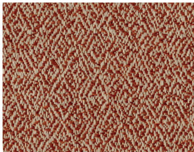
CM-04 Coucher de soleil