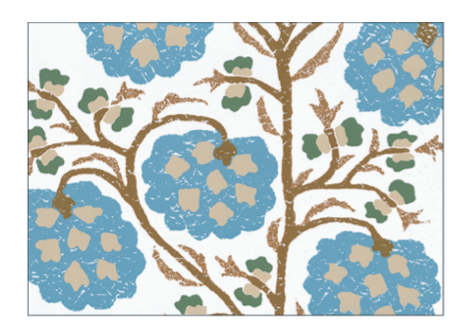
UZ13-01 Alabaster Ambrosia

Hand Screened Wallpaper 27" Wide 23.5" Vertical Repeat 6.5" Horizontal Repeat 5 Roll minimun Shipped in Double Rolls (10 yards) or Triple Rolls (15 yards) Paper is wipeable not scrubable