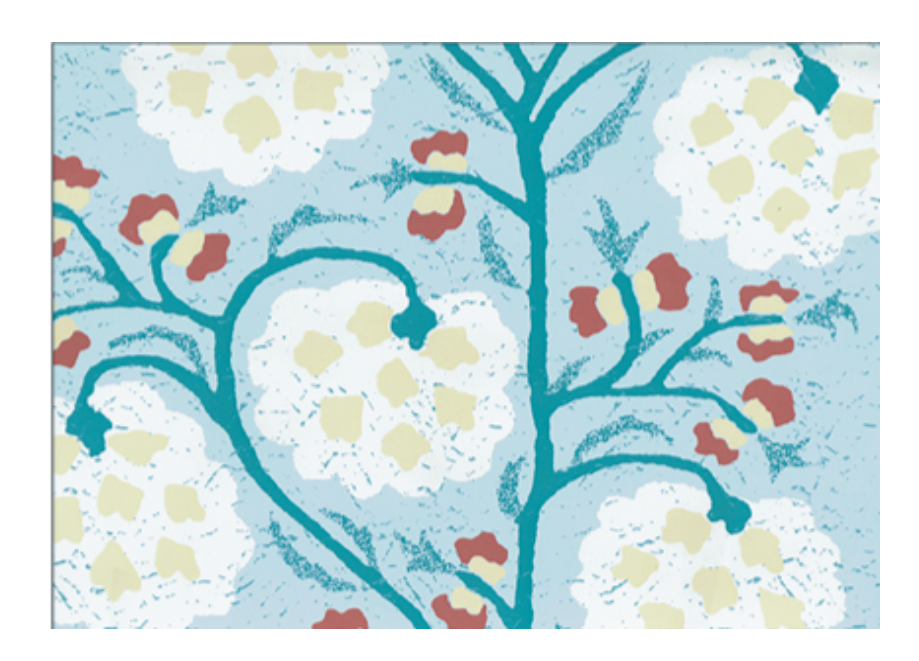
UZ13-03 Summer's Delight