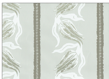
TLI2-01 Platinum Putty