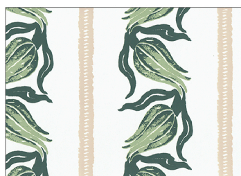
TLI2-05 Pretty Pearl