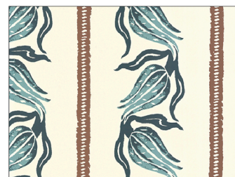
TLI2-04 Indigo Fig