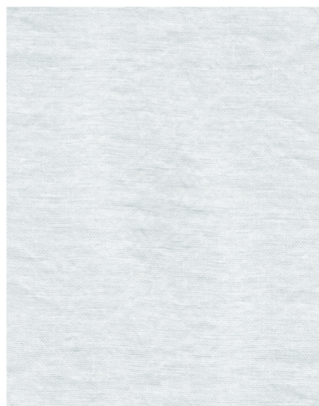
MUM-01 Soft White