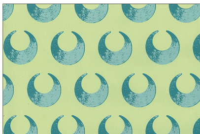
LU10-05 Teal on String