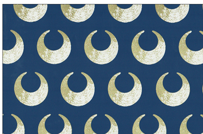
LU10-04 Cobalt Crescent