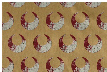
LU10-06 Antique Aubergine

Contact us at hello@katieleede.com to inquire about our custom capabilities for this design.