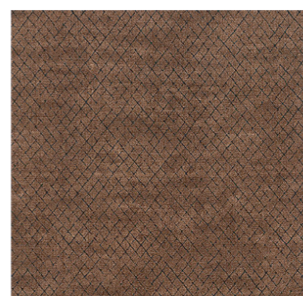
KA-07 Raisin *