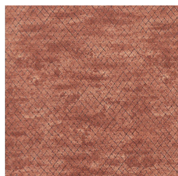
KA-03 Scorpion *