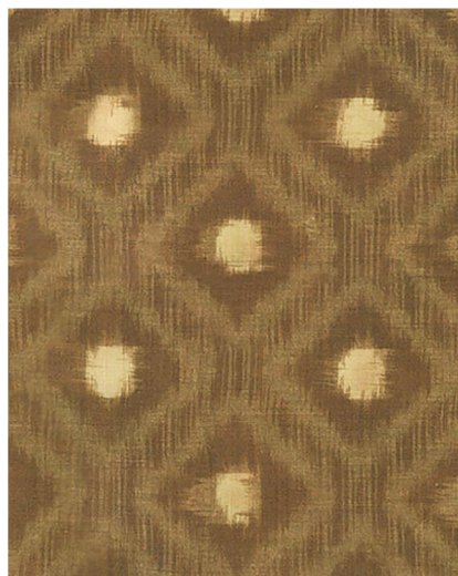
IK-02 Tea Leaves