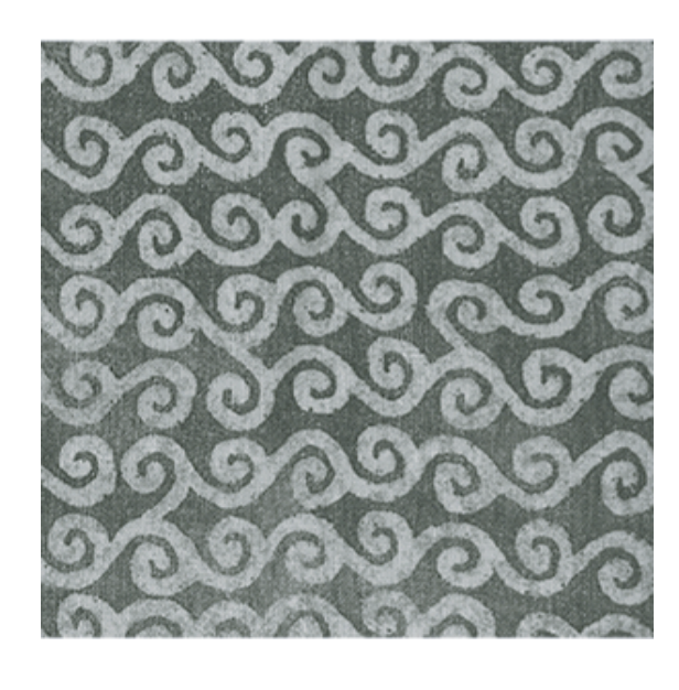
CSN-05 Storm *