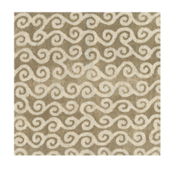
CSN-03 Allspice *