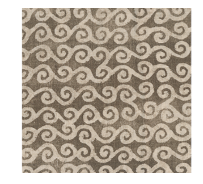
CSN-02 Mahogany *