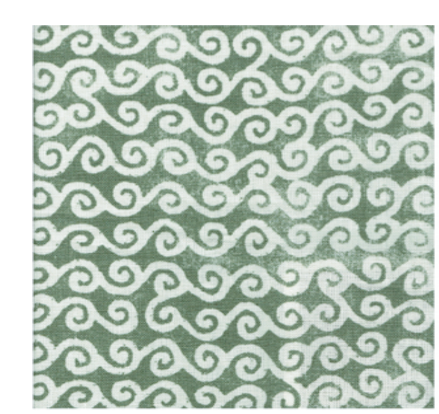
CSN-09 Chard *